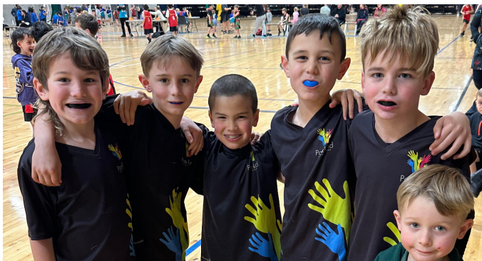
Parkland Raptors - Runner Up - Division 2