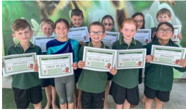
Middle Team Speech Finalists

A group of Year 5 & 6 girls played in the 'Girls Only' Futsal Festival at the Arena last term. Lots of fun, smiles and skills.