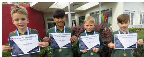
Ruahine AFC 9th Grade Lions