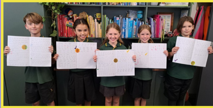
Congratulations to the super stars in Room 8 who produced excellent Code work! Their book presentation is excellent too! Ka pai!

Huge thanks to the members of our community who helped at our mini working bee to spread pour playground bark. We appreciate your hard work!